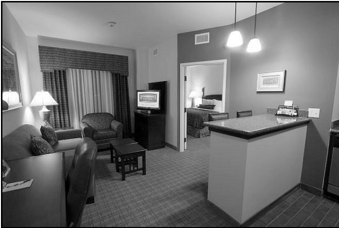
ONE-BEDROOM WITH KITCHEN/BAR