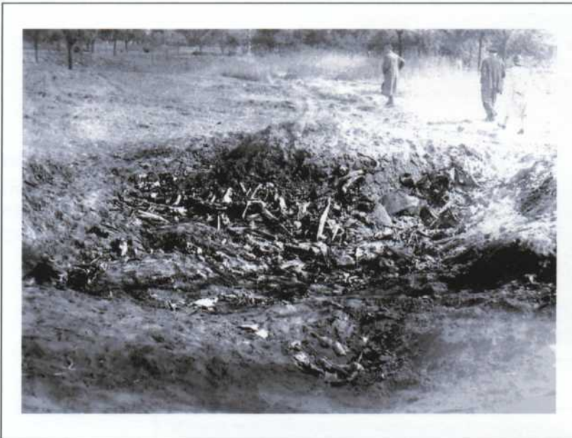
The crash site of a P-47 that went straight in.