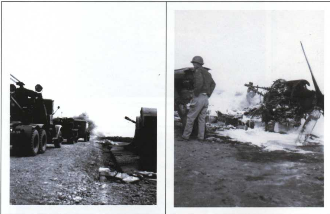
The end of plane number 31, which was the first plane assigned to me. I was not flying it at this time and I don't remember what happened.